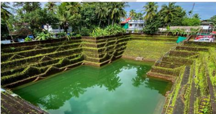
Water heritage sites in kerala – 2